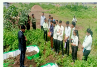
Training on Vermicomposting Set-up