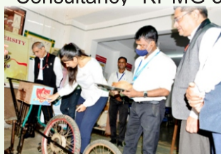
Innovations in Agri-tools