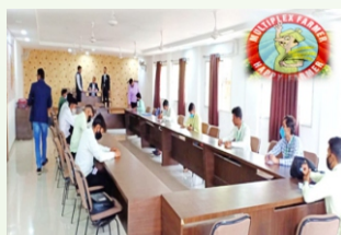
Student Placement Interactions