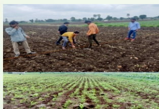
Sowing at Agri-Field