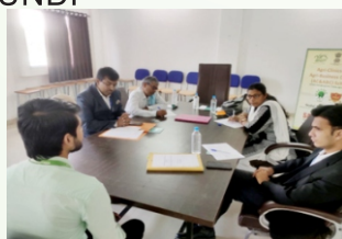
Managed AC & ABC Program