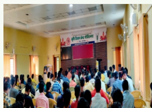
Students in RAW Training at KVK