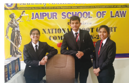
National Moot Courts Competition