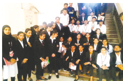
Session Court Visit