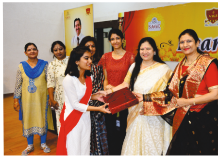
Women's Day Celebration