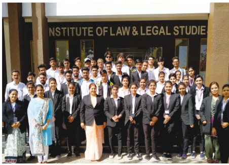
Institute of Law & Legal Studies