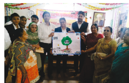
Old Age Home Visit